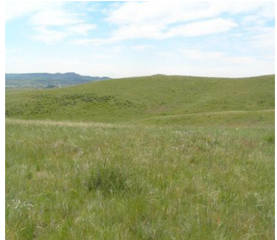
Non-Irrigated Native Vegetation in Northwest Douglas County

Colorado’s water rights system is based on the prior appropriation doctrine, “first in time, first in right”, which protects senior water rights. All precipitation is assumed to ultimately contribute to stream flows and is part and parcel of the water that existing water rights are entitled to. Current Colorado water law requires 100% of precipitation that is captured to be replaced in like time, place, and amount. This does not account for the fact that some of the precipitation may have historically been consumed by native vegetation and never made it back to the stream. There are non-irrigated areas throughout the state, such as the one shown here in northwest Douglas County, where green fields in the spring and early summer provide evidence that some of the precipitation was consumed by the vegetation.