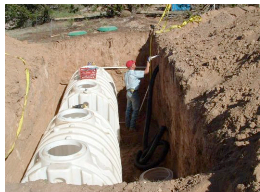
Underground Residential Cistern