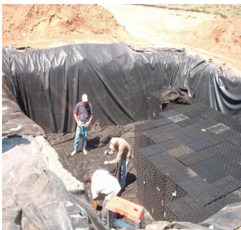
Construction of an Underground Structural Storage Tank in Rancho Viejo, New Mexico