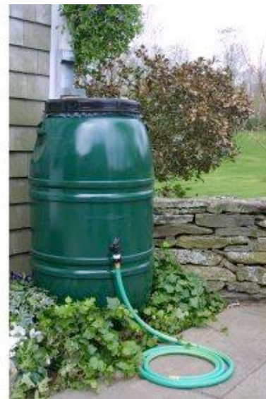
Small Scale Rain Barrel