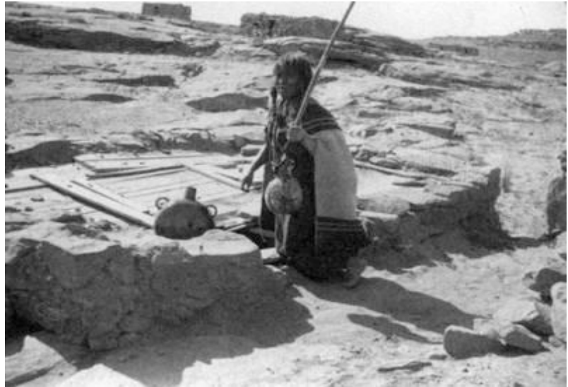
Woman Drawing Water from Cistern at Orabi Pueblo (circa 1880-1900)

because Colorado water law severely inhibits its use. The purpose of this document is to provide information on rainwater harvesting and to describe how proposed legislation could allow Coloradans to test the concept at a local level while protecting existing water users.