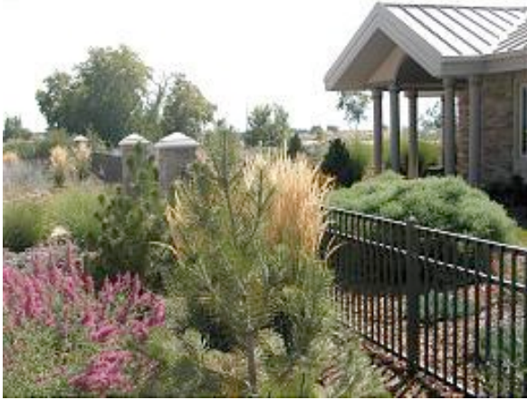
Example of Water Wise Landscaping

The study considered the benefits of pairing rainwater harvesting in northwest Douglas County with water wise landscaping, which included 1,000 square feet of turf and 500 square feet of plantings. With a 1,500 square foot roof and 5,000 gallon cistern, even after considering some losses in the capture process, the study found that, on average, rainwater could provide almost half of the supply for water wise landscape. Typical residential underground cisterns run around $10,000 to $15,000 (installed) whereas the above ground systems are significantly less expensive. Although there is initial investment for the underground system, the homeowner and the water provider realize multiple savings from the benefits described above. The payback period was