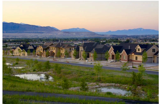
Regional Rainwater Catchments Daybreak Community – Salt Lake City, Utah

In addition to structural systems, rainwater harvesting can be practiced on a larger scale, within a subdivision, for example, where rain or snowmelt is collected from impervious surfaces and stored in regional catchments for later irrigation use. These systems integrate rainwater harvesting into the stormwater control systems that are mandatory for most developments.